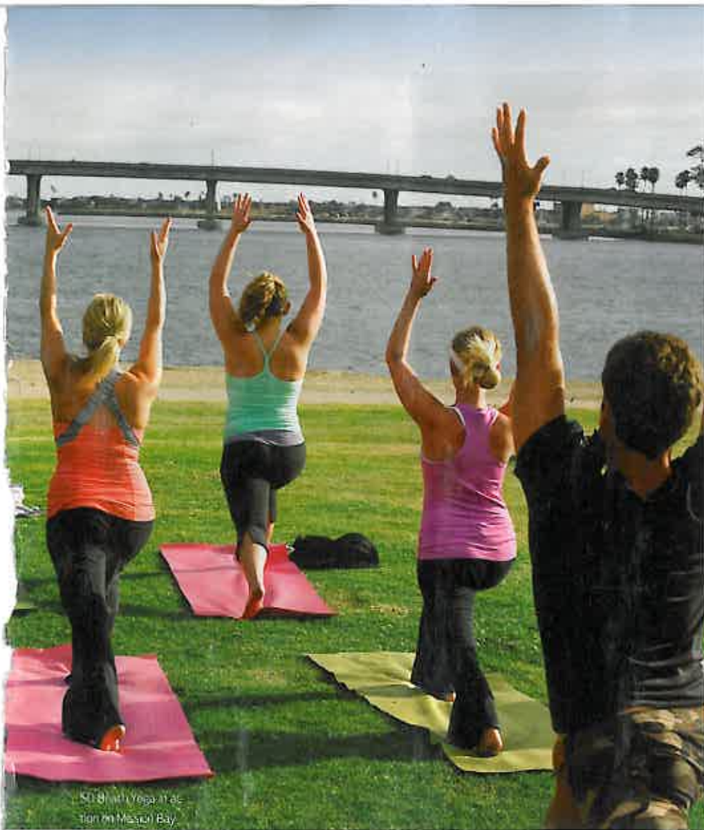
KID Yoga: Practice on Mission Bay.