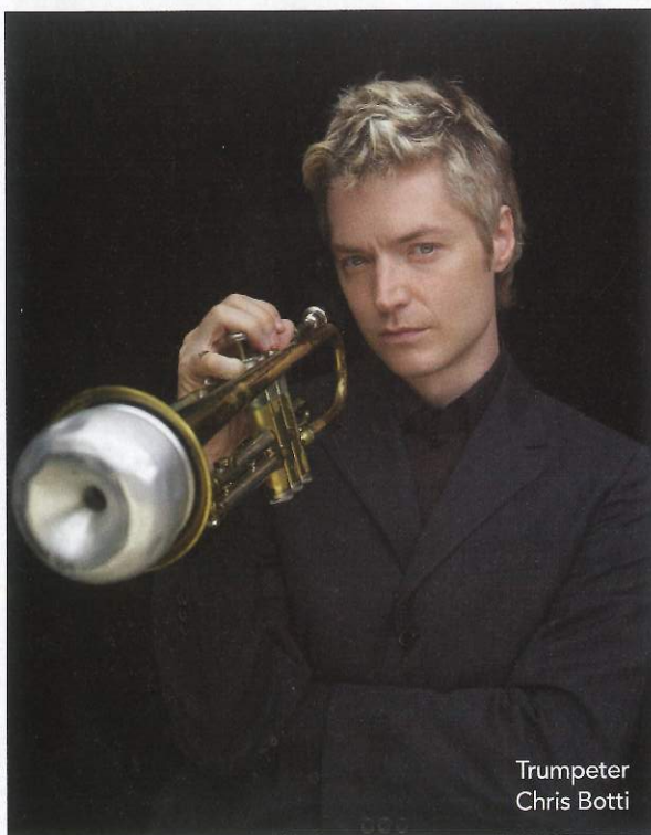
Trumpeter Chris Botti